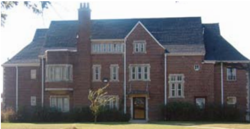
Walter Starr Hall

Once a student selects a major, the BAC guides the student through the First-Year Experience, introductory classes in their chosen discipline, and other core curriculum courses. Meeting this threshold is an important passage in a student's academic experience at Bacone. Those who opt for General Studies, a two-year degree, will remain with the BAC throughout their time at Bacone, assigned to the Director of the Bacone Advising Center.